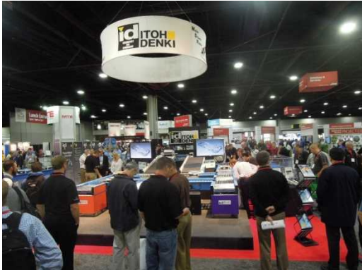
Automation Fair 2016 (Atlanta, U.S.A.)

Promoting the Itoh Denki brand globally.