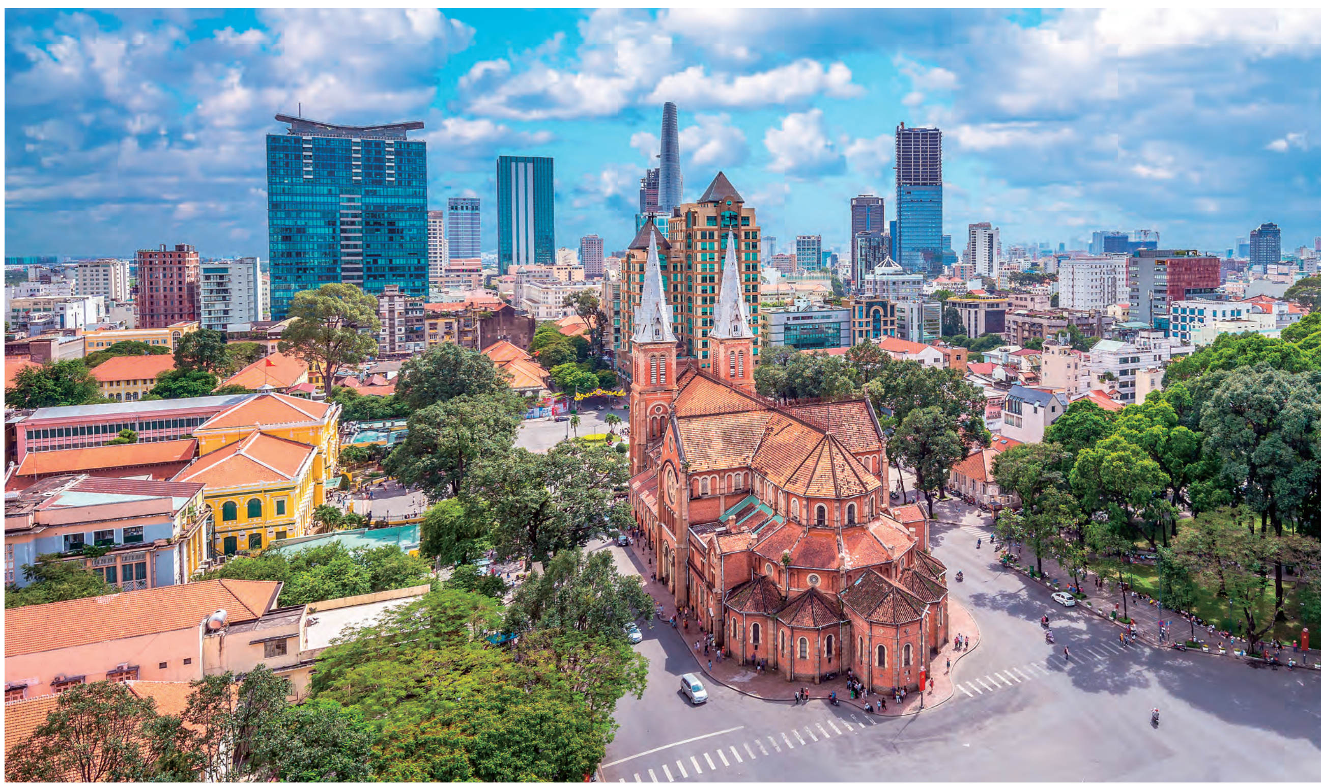
東洋のパリと呼ばれた街並み City referred to as the "Paris of the Orient"