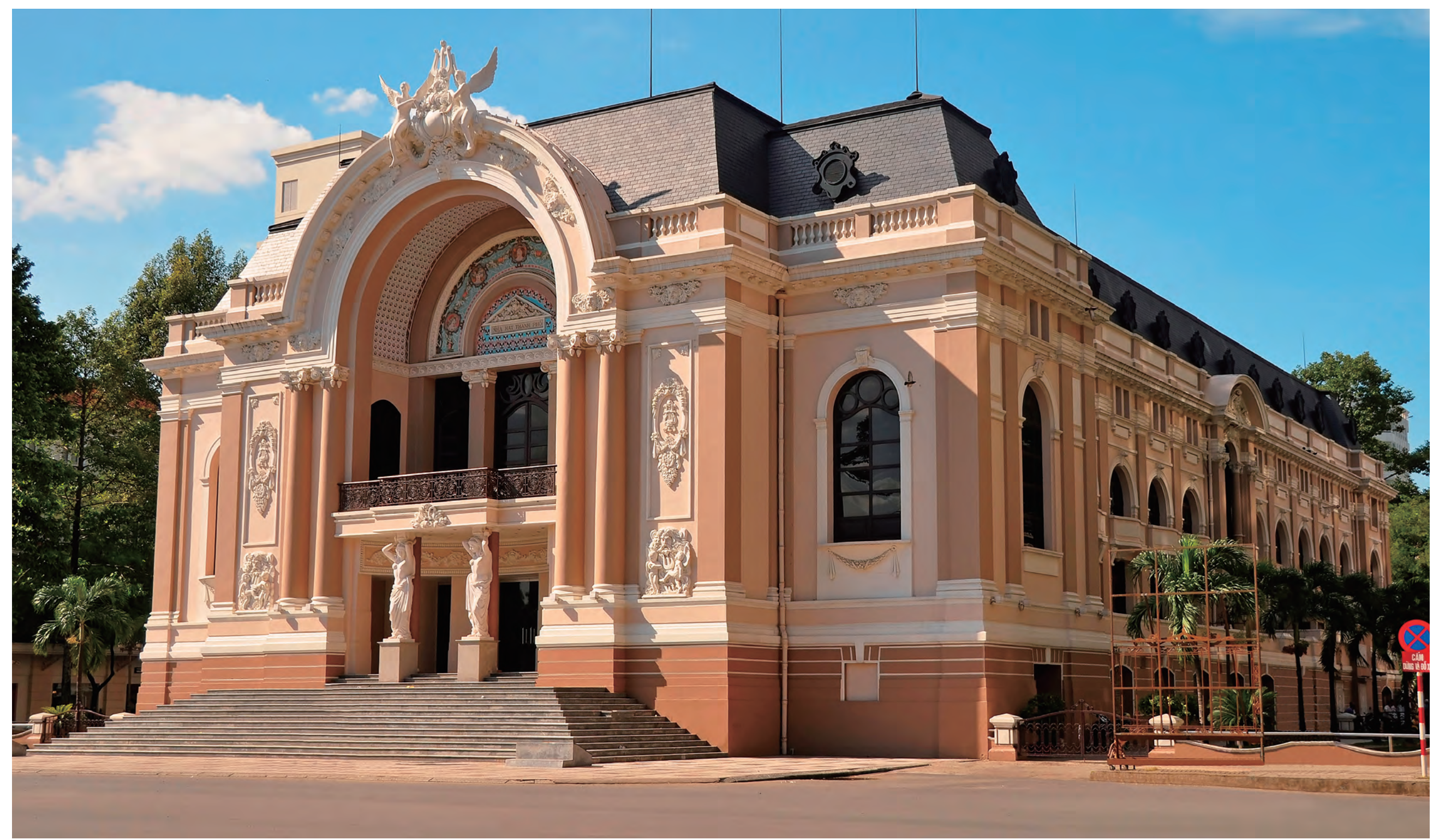
コロニアル建築様式のサイゴンオペラハウス Saigon Opera House with French colonial architecture