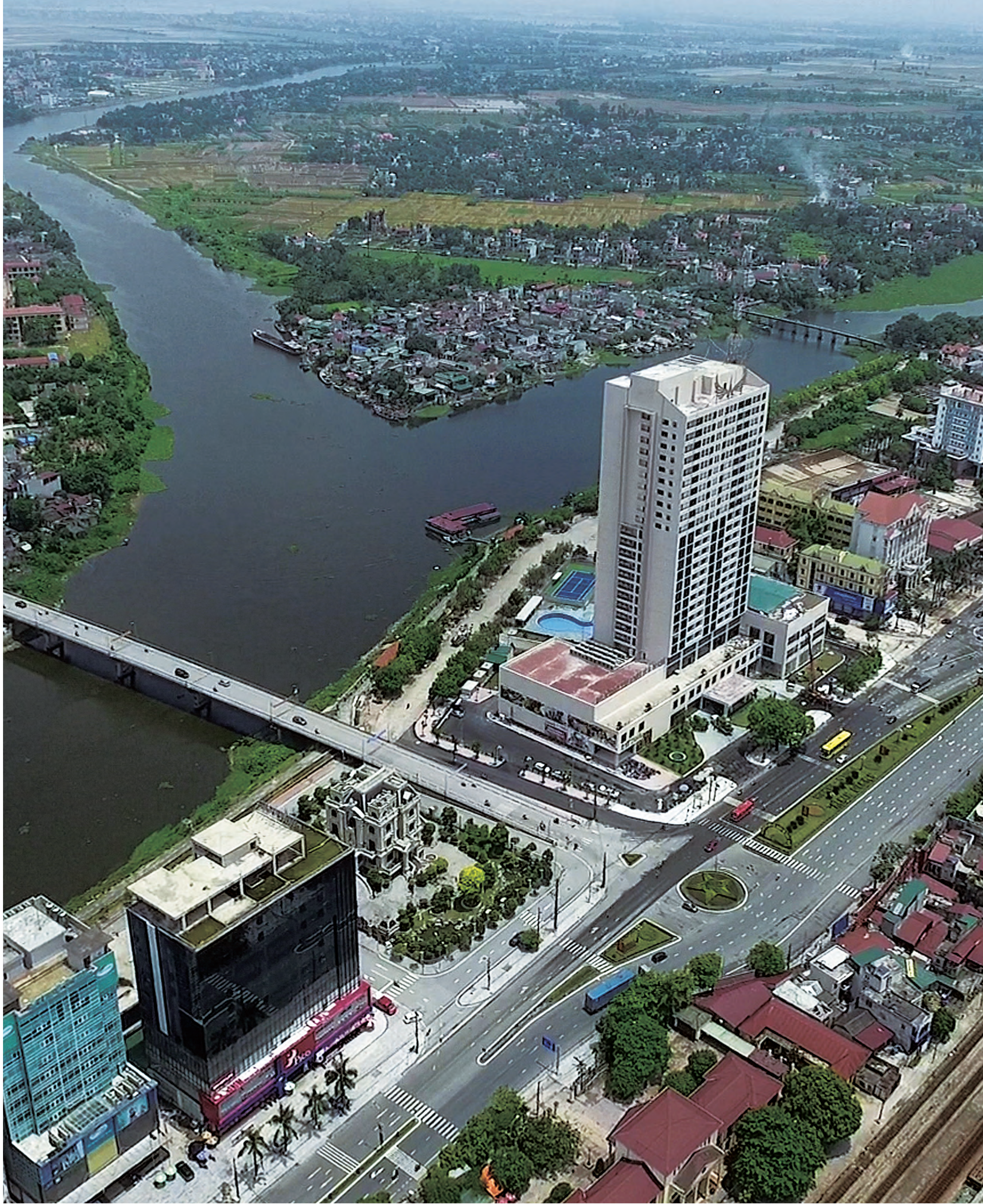
省都フーリー市中心部 Central area of the capital, Phu Ly