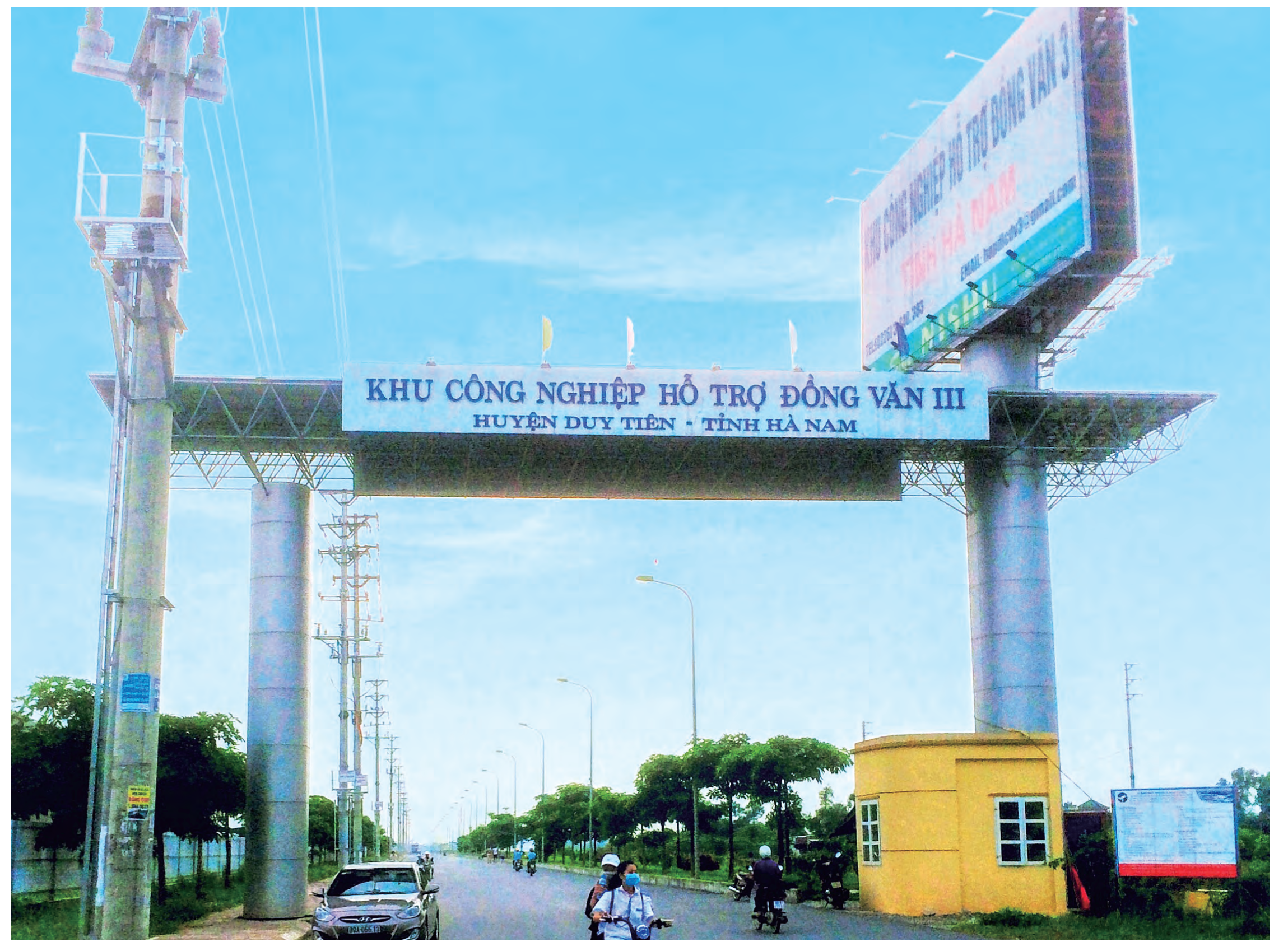
ドンバンIII工業団地 Dong Van III industrial park