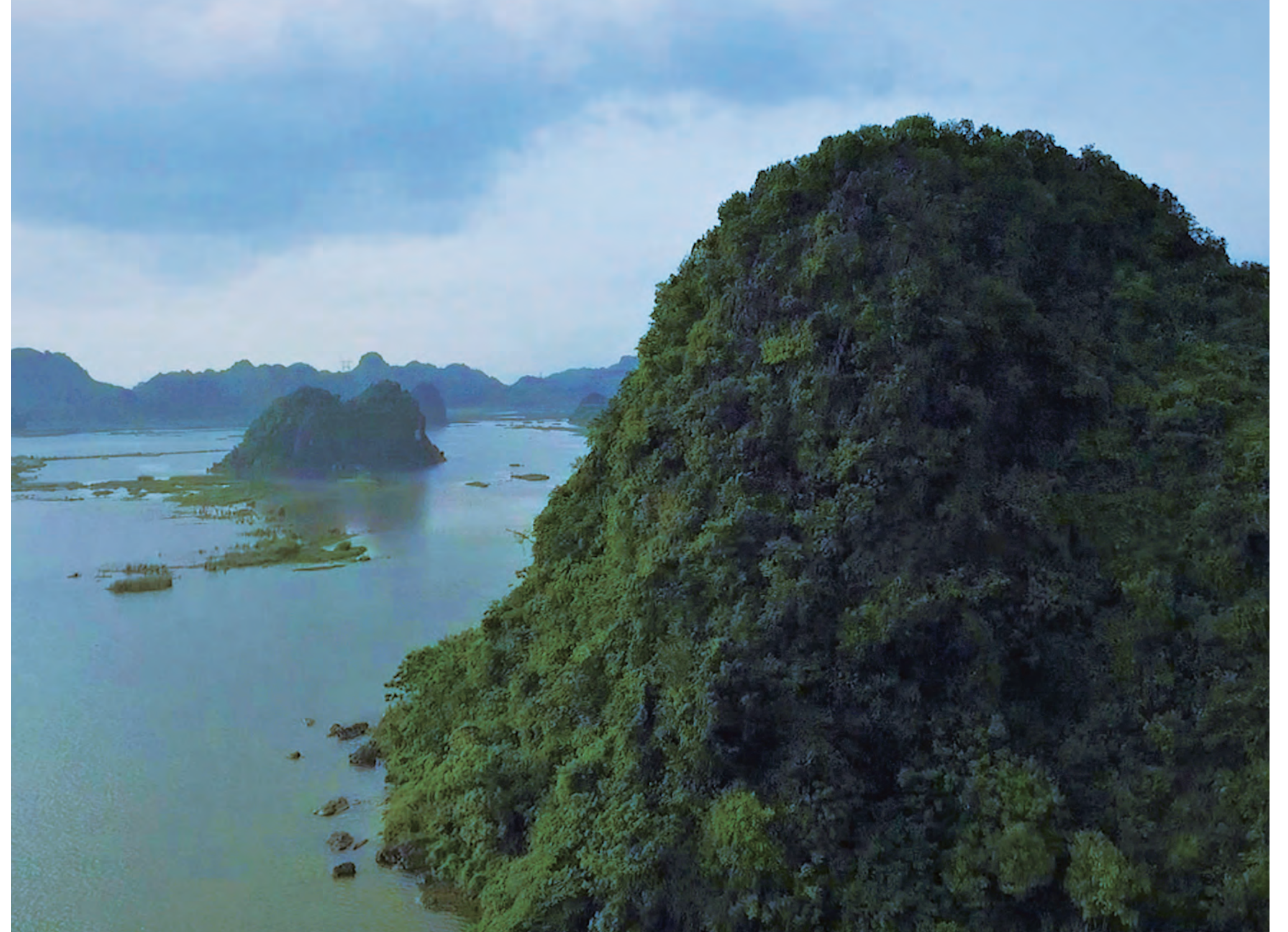
タムチュックリゾートエリア Tam Chuc National Tourism Area